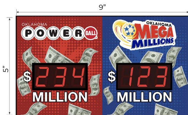
2-Game Jackpot Sign