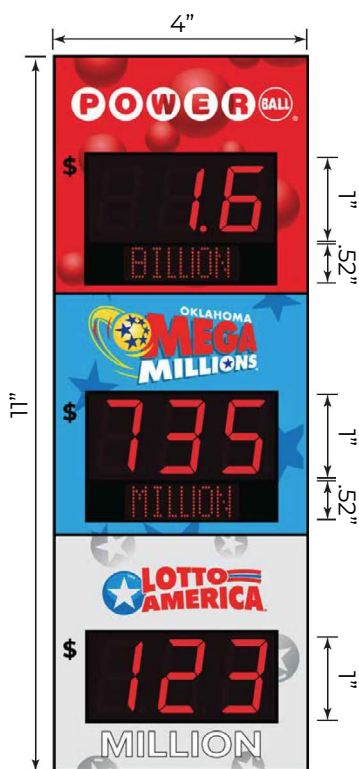
3-Game Jackpot Sign