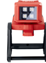
SL 6-22 Light