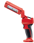
SL 2-A12 Task light