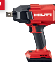
SIW 10-22 3/4" Impact Wrench