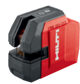
PM 20-CG Plumb and cross line laser