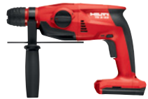
TE 2-22 Rotary hammer