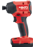
SID 6-22 Impact driver