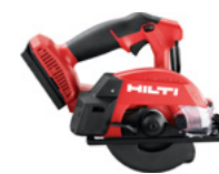
SC 4MR-22 Metal cutting circular saw (5.3/8") blade right