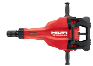
TE 2000-22 Breaker TE-S Connection