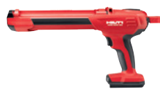
HDE 500-22 w/ red cartr. holder Anchor dispenser