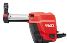
DRS 4/6 Onboard dust solution