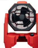
KCF 4-22 Cordless Jobsite Fan