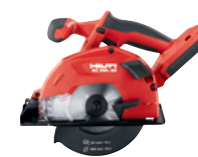
SC 5ML-22 Metal cutting circular saw (6.5") blade left