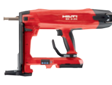
BX 3-22 (ME) Battery fastener