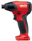
SID 2-A12 Impact driver (1/4" chuck)

IMPACT DRIVER — SCREW DRIVER — DRILL DRIVER — IMPACT WRENCH — DISPENSERS —