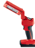
SL 2-22 Light