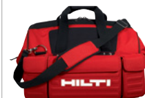
Large tool bag