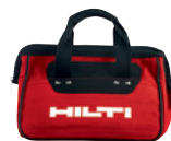
Small tool bag