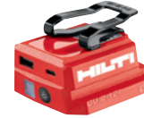
CU 2-12 USB Charging Adapter (12V)