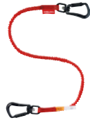
Tool Tether (15 lbs)