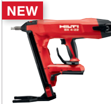
BX 4-22 (M&E) Battery fastener