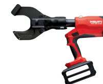
NCT 85 C-22 CU/AL Cutter