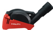
5" Tuck Point Cutting Kit