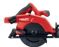
SC 30 WR-22 Wood cutting circular saw (7.25") blade right