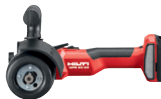
GPB 6X-22 Burnisher