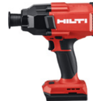
SID 8-22 Impact driver