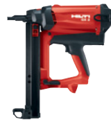
GX 2 Gas fastener