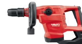
TE 500-22 Breaker SDS Max