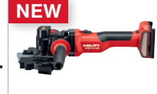
NRC 6-22 Rebar Flush Cutter