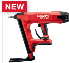
BX 4-22 (IF) Battery fastener