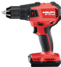
SF 4H-22 Hammer Drill Driver