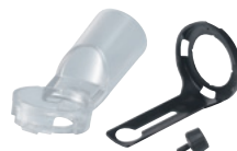
DRS SCO-22 Dust removal system