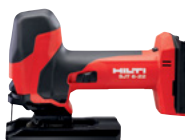
SJT 6-22 Jigsaw T handle