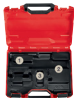
Hard case for Nuron combo

Holds 2x Nuron UCD tools, 2x Nuron batteries, 1x Nuron charger