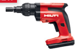
ST 2000-22 Metal Construction Screwdriver