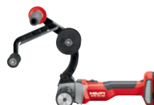
GTB 6X-22 Tube belt sander