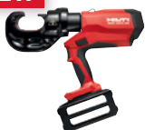
NCR 120C-22 Coated 12 Ton Crimper