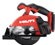
SC 6ML-22 Metal cutting circular saw (6.5")