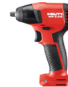
SIW 2-A12 Impact Wrench