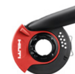
DG-EX 115 4.5" Grinding Hood