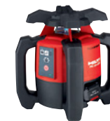
PR 30-HVS Red rotating laser