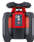
PR 30-HVSG Green rotating laser