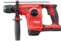
TE 6-22 Rotary hammer SDS Plus