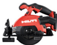
SC 6WL-22 Wood cutting circular saw (6.5")