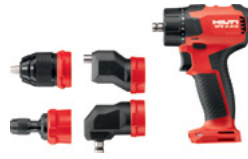
SFE-A12 Installation drill