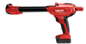
HDE 500-A12 Dispenser