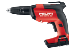
SD 5000-22 Drywall screw gun