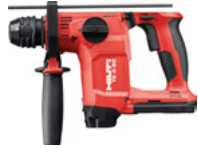
TE 4-22 Compact rotary hammer drill