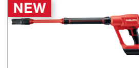
PC 2-22 Pressure Cleaner