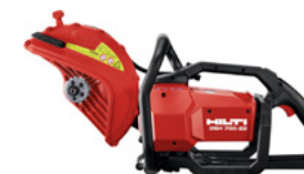
DSH 700-22 12" Cut-off saw