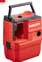
VC 4X-22 & T8 Vacuum