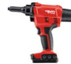
RT 6-22 Riveting tool