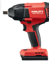
SIW 6AT-22 Impact Wrench