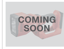
SL 4-22 Search Light