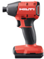
SID 4-22 Impact driver