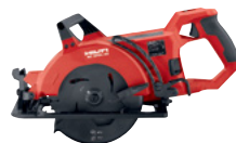
SC 30 WL-22 Wood cutting circular saw (7.25") blade left