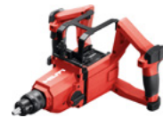
NMX 6-22 Mixer