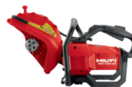
DSH 600-22 12" Cut-off saw