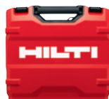
Hard case for TE DRS 4/6-22 + TE DRS 4/6 Dust removal system