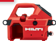
NUN 10K-22 10,000psi Hydraulic Pump