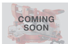
SM 60-22 Cordl. Miter Saw