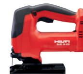
SJD 6-22 Jigsaw D handle