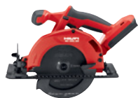
SC 4 WL-22 Wood cutting circular saw (6.5") blade left