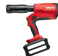
NPR 32 XL-22 Press tool (pistol grip)