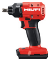
SIW 4AT-22 Impact wrench