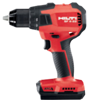
SF 4-22 Drill driver