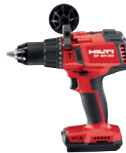
SF 6H ATC-22 Drill driver