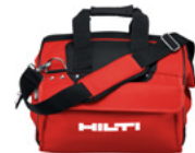
Medium tool bag