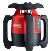
PR 3-HVSG Green rotating laser