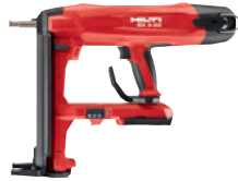
BX 3-22 (IF) Battery fastener