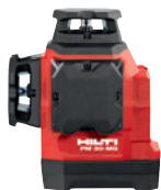
PM 30-MG Green multiline laser