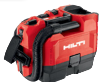
VC 2D-22 Vacuum