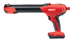
HDE 500-22 w/ black cartr. holder Anchor dispenser