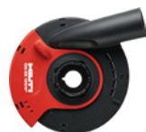
DG-EX 125 5" Grinding Hood