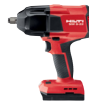
SIW 8-22 Impact wrench