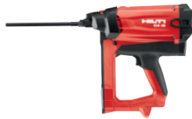
GX-IE Gas insulation fastener