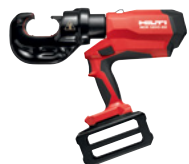
NCR 120-22 12 Ton Crimper