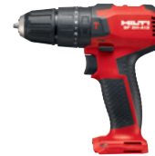
SF 2H-A12 Hammer drill driver