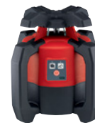
PR 2-HS Red rotating laser