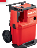
VC 4X-22 & T15 Vacuum