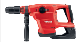
TE 60-22 Combi-hammer SDS Max