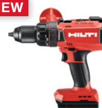
SF 10W-22 Drill driver