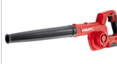
NBL 4-22 Blower