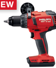
SBT 6-22 Specialty drill driver