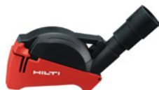
DC-EX 115 4.5" Dust Extr. Cutting Hood