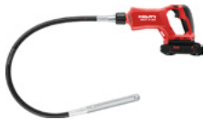
NCV 4-22 Compact concrete vibrator