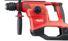
TE 30-22 Combi-hammer SDS Plus